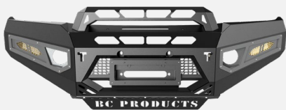
FABED LOW HOOP